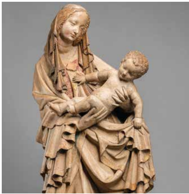
Madonna from Hluboká nad Vltavou, 1400, National Gallery Prague

6 Dec-19 Apr National Gallery Prague – Convent of St Agnes of Bohemia, Anežská 12, Prague 1 – Old Town nprague.cz In approximately 1400, depictions of the elegantly posing young Mother of Jesus with a crown wearing a flowing robe and holding the naked Infant Jesus in her arms – the Beautiful Madonnas – enjoyed great popularity all over Europe. The exhibition displays around thirty significant artworks in the Beautiful style, some that were discovered only recently, and several which are on display for the first time.