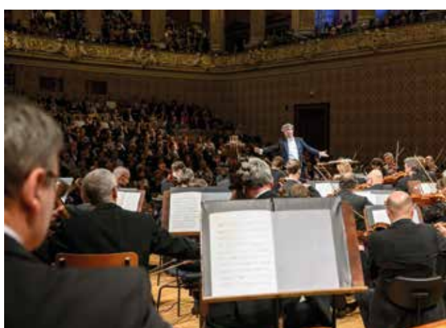
Concert Hall

26, 27 & 28 Feb Rudolfinum, Alšovo nábřeží embankment 79/12, Prague 1 – Old Town ceskafilharmonie.cz The programme features Beethoven's Fourth Symphony and First Piano Concerto along with a suite from the high Baroque opera Hippolyte and Aricie by Jean-Philippe Rameau. The Czech Philharmonic will accompany the phenomenal Austrian pianist Rudolf Buchbinder.